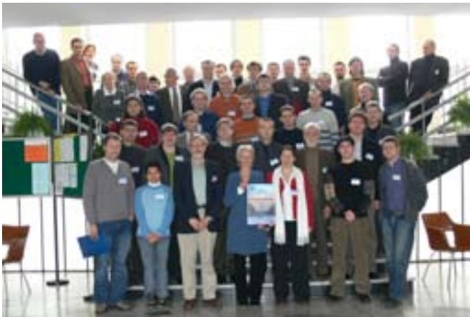
Members of BalticGrid at the kick-off meeting and first conference, held in Krakow, Poland.

Gathering key institutions from the three new EU member states Estonia, Latvia and Lithuania and a number of institutions with experience from previous and ongoing Grid projects, from Poland, Switzerland and Sweden, the project has the mix of partners